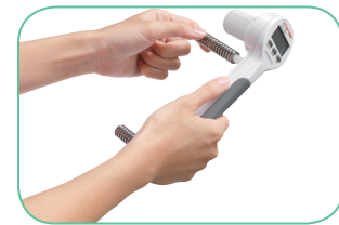
Multiple spring options