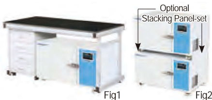
Fig1 ; Under-bench Installation Fig2 ; 2 unit Stacked with Optional Stacking Panel-set