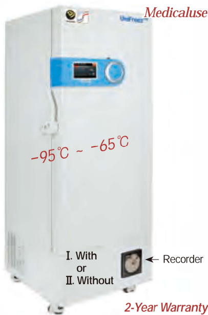
ULT Freezer "Fre500-B95"