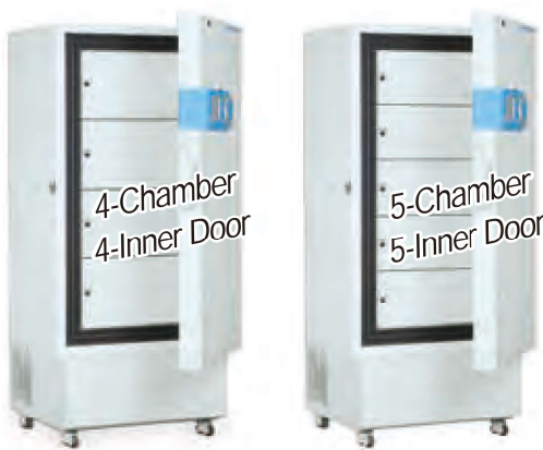
ULT Freezer "Fre500-B86"

※ Note! You can choose 4 or 5 Inner Doors Model