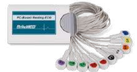
12-lead portable ECG