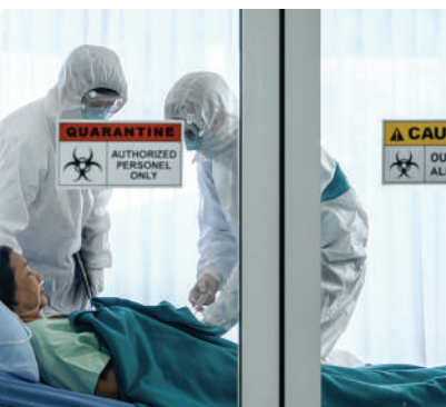
Tele-ICU/ Isolation Room