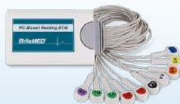
12-lead portable ECG