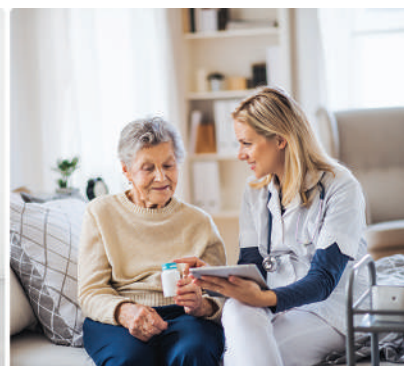
Home-Based Patient Care