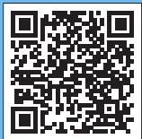
Advantech Medical Cart